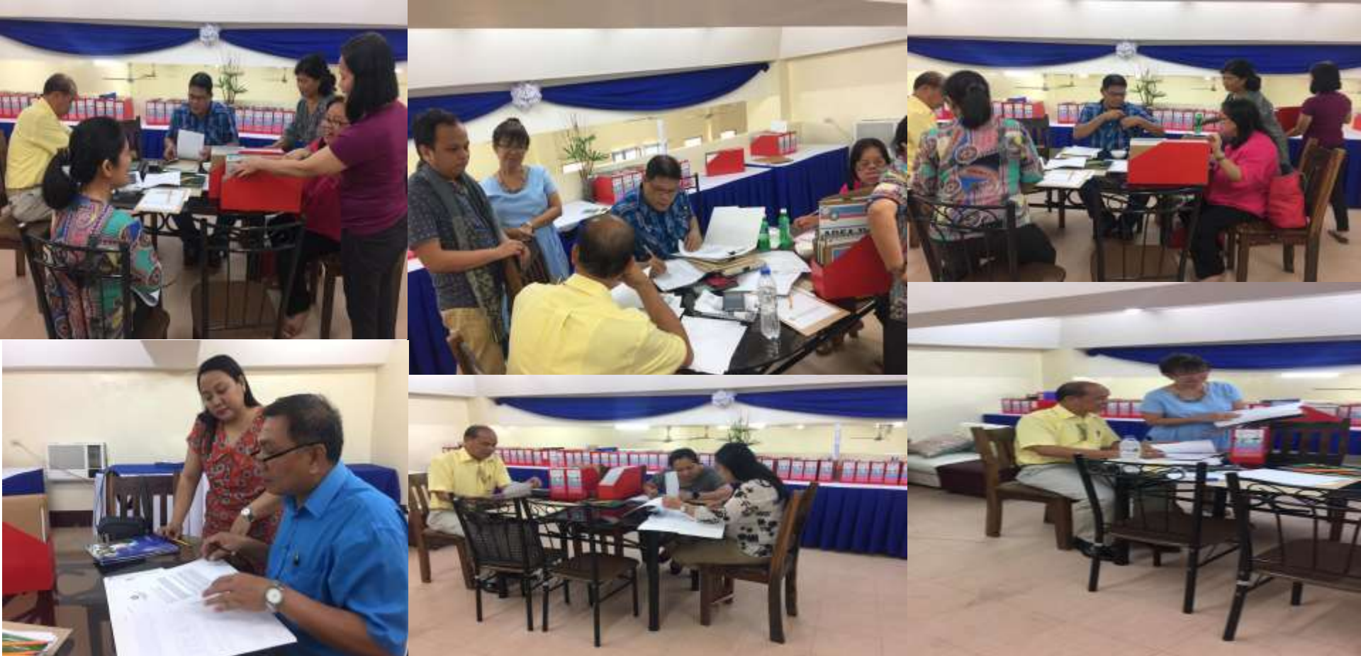
Preliminary Survey Visit of the Master of Arts in Nursing Program